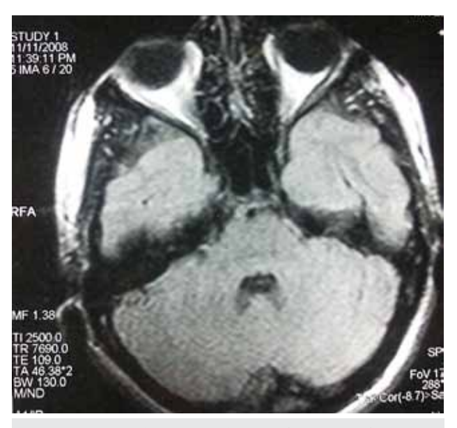
Picture 4: Basal pontine lesion disappeared at MR imaging taken 9 months after the treatment.

thought (Picture 3). Cho/Cr ratio was 3.2 and NAA/ Cr ratio was 2. Neurosurgery department evaluated the patient and decided to follow-up the lesion by